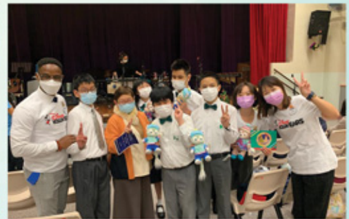
兩位迪士尼大使其後也有到校參與《生命的光》聖誕音樂會 The two ambassadors also participated in the Guiding Light concert held in our school hall in late December