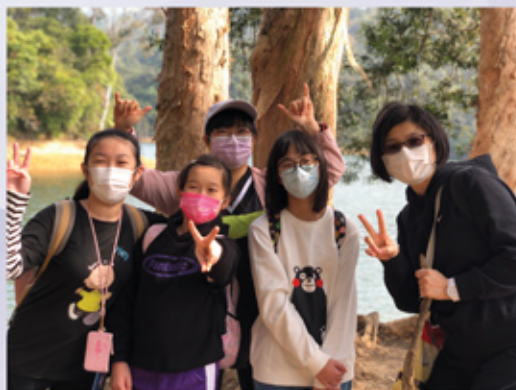
城門水塘是不少劇集的取景勝地，同學當然也要拍照留念 Students are thrilled to visit Shing Mun Reservoir – one of the most popular filming locations in Hong Kong