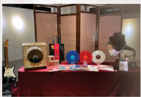
CEDAR Workshop與「愛連心」基金於中環站內進行產品展覽 CEDAR Workshop and Les Beattitudes Foundation Products Exhibition at Central Station