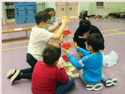
學生攜手創建高塔 Students join hands to build a tower