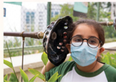
溝通無界限 Communication without boundaries