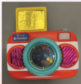
老師協助家長調適家中玩具作教材 Demonstrating how toys can be used for training