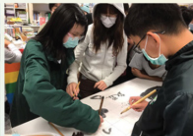
中學生體驗書法 Secondary students trying Chinese calligraphy