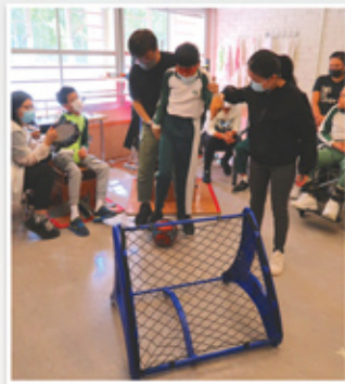
線上校內運動會 Online Sports Day