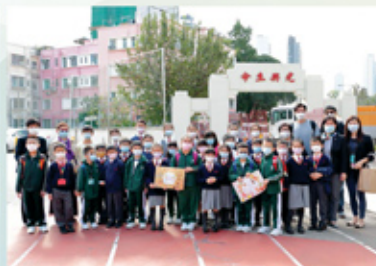
小學感恩節活動 Munsang Thanksgiving activities