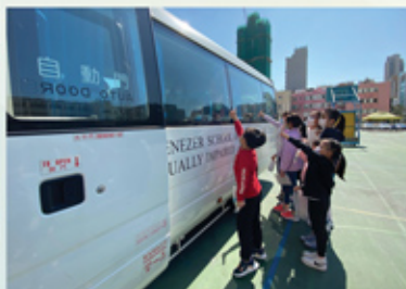
依依不捨說再見 Goodbye! We will miss you!