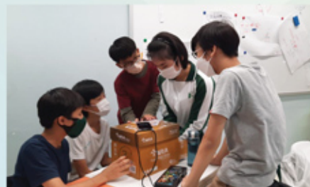
中學探究學習活動 Inquiry-based learning activities in the lesson