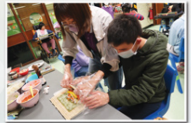
「童理想飛」活動：製作韓式美食 The Flying with Kids event: making Korean food