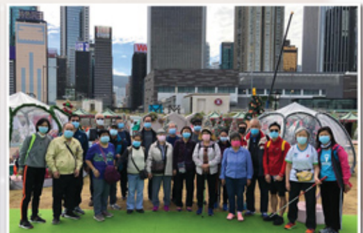
聖誕灣仔海濱行 Wan Chai Waterfront Promenade Christmas Walk