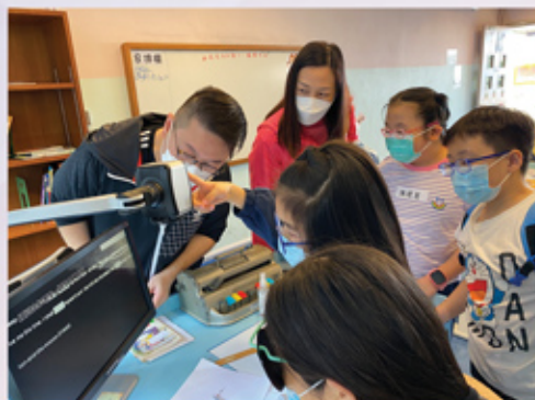
親子合作利用桌面放大機破解謎題 Working to solve the puzzle using a desktop magnifier