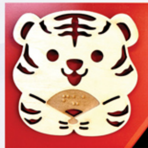
特別為虎年製作的「虎」點字杯墊 Braille wooden tiger coaster designed to celebrate the year of the Tiger