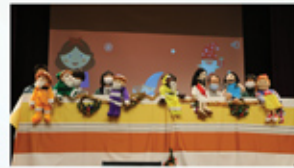
心光學校學生演出布偶劇 The puppet show performed by Ebenezer School students