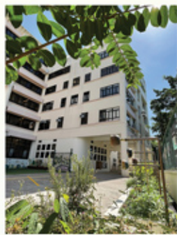
陶瓷傳聲筒為校園增添藝術色彩 A touch of art brought by the ceramic string telephones

「藝想」與心光稍後仍有另一創作活動，名為「我們的星空」。藝術家會與心光學生共同創作陶瓷片，再結合混合媒體，暫定於2022年底於堅尼地城海濱長廊，與其他本地及海外藝術家一同展出作品，藉此連繫各界人士，傳遞希望與祝福的訊息！