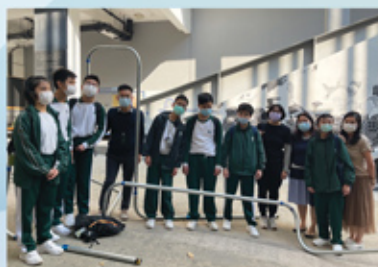
在書院校園喜遇心光師姐（右四） Surprised to meet an Ebenezer alumnus at HKSC (fourth right)