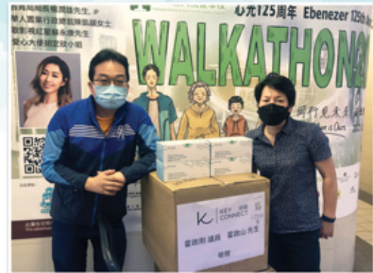
特別感謝立法局議員霍啟剛, JP為心光送上防疫物資 Thanks to The Hon. Mr. Kenneth Fok, JP, for his kind donation