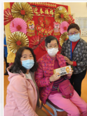
「金虎與共迎新年」之「漫步人生路獎勵計劃」頒獎 Presentation of Strolling Through Life Award to start the celebration of the year of the Tiger