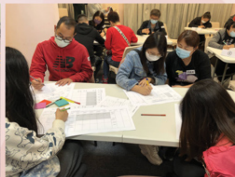
家長用心規劃「自家時間表」 Parents devising family schedules