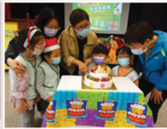
幼兒中心15周年慶祝活動暨聖誕聯歡會 The 15th Anniversary Celebration of Ebenezer Child Care Centre cum Christmas Party