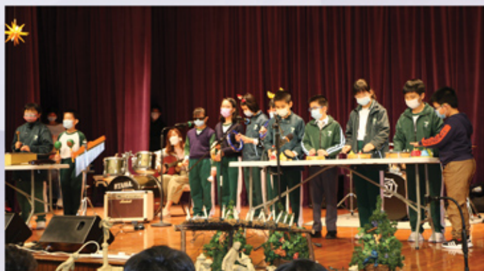
心光學校小三至小六聯樂隊表演 Performance by the P.3-6 Percussion Band from Ebenezer school