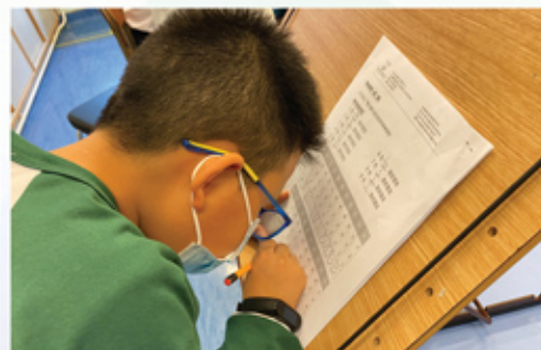
學生操練珠心算題目 Students do exercises to train mental calculation