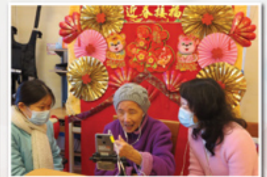
「情牽一線」初三團拜 Warm blessings with family members through video call at Chinese New Year