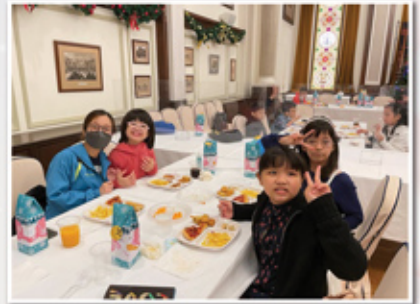
學生出席羅仁會館聖誕共融派對 Students attend the inclusive Baked Alaska Christmas Party at Zetland Hall