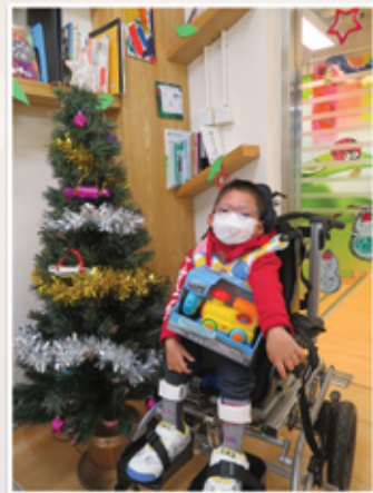
聖誕快樂 Merry Christmas!