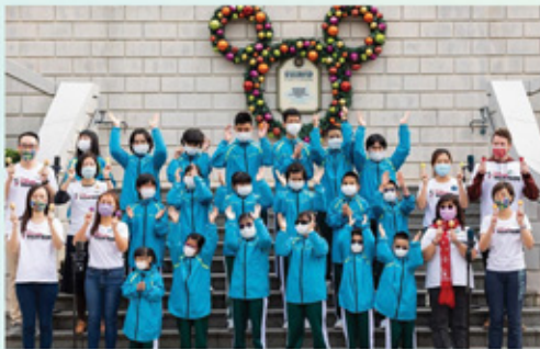
心光合唱團獲香港迪士尼邀請演出 Ebenezer Choir was invited by the HK Disneyland to perform with their team