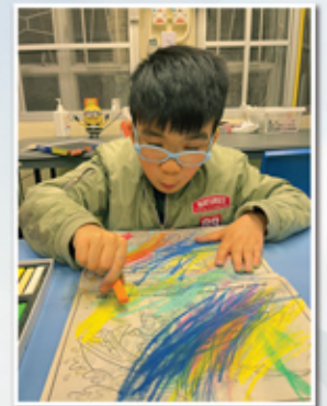
小小藝術家 Little artist