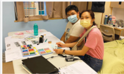
同學與宿舍家長練習使用和諧粉彩 Boarders and house-parents learning pastel nagomi art together