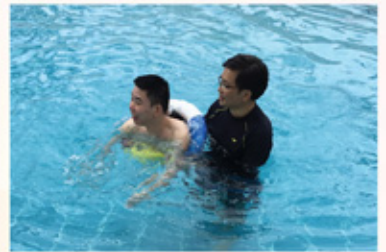
同學利用輔具學習游泳 Using floats to learn swimming