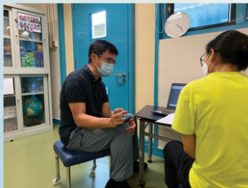
資源老師與班主任討論學生的訓練重點 Resource teacher and class teacher discussing students' training objectives