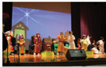
心光幼兒中心學生重現聖景 The nativity scene performed by Ebenezer Child Care Centre students