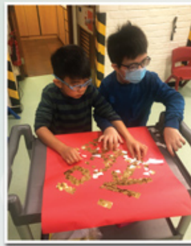
宿舍新年佈置 Chinese New Year decoration in the dormitory