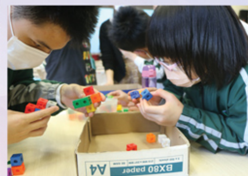
學生參與數學攤位遊戲 Students participate in the game booths