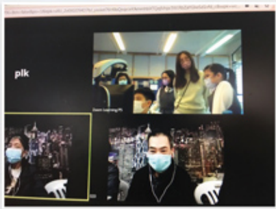
小五和小六學生與老人院長者聊天和分享聖誕詩歌 P.5 and P.6 students chat and sing Christmas hymns with the elderly through Zoom