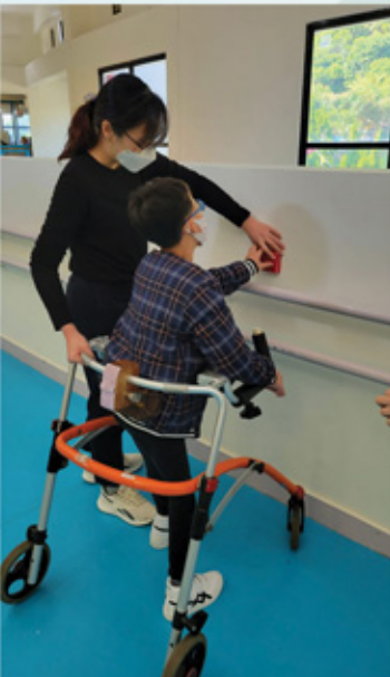
在視覺訓練中加入定向行走元素 Integrating pre-Orientation and Mobility training in the visual training lesson

RSP資源老師會與協作學校教職員和治療師時刻保持緊密溝通，以跨專業合作模式支援學童整體學習及訓練，讓學生在有效和安全的情況下進行訓練（例如：定向行走）。期望學童在建立基本能力及個別化的學習模式後，能應用在日常學習和生活中。