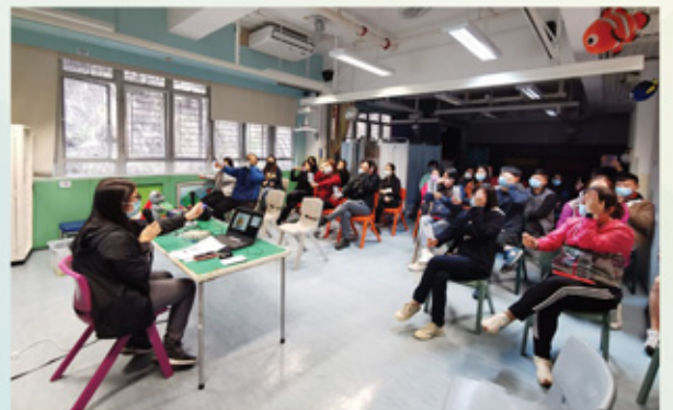
資源老師向協作學校教職員分享有關視障的知識 Resource teacher sharing with partner school staff on CVI and OVI