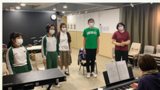
參演同學由2021年10月份開始進行歌唱訓練 The participating students started their vocal training in October

由香港藝術節主辦的「無限亮」計劃旨在推廣藝術共融 The "No Limits" programme organized by the Hong Kong Arts Festival aims to promote inclusiveness through Arts