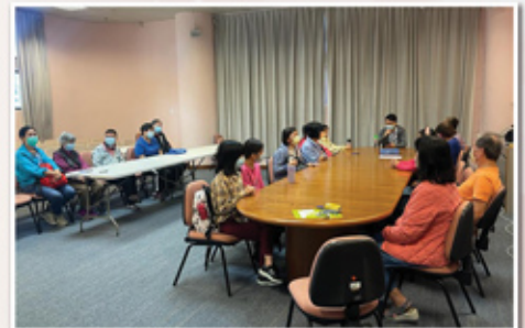
中醫養生講座 Health talk given by a Chinese medicine practitioner