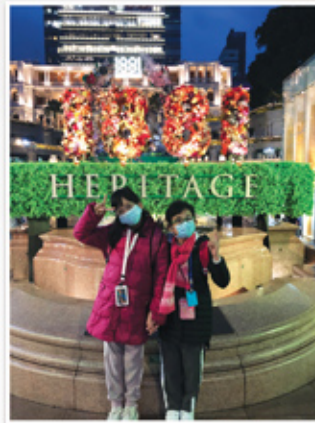
與同學一同歡度聖誕 Having a great time seeing the Christmas lights