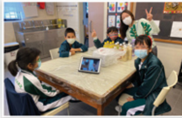
身處內地的學生透過即時通訊軟件與老師、同學一起歡聚聖誕 Our student in mainland joins the Christmas party through Zoom