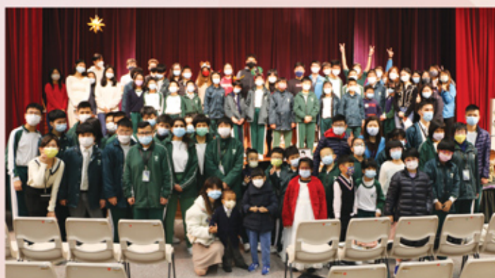
兩校師生大合照 Group photo taken at the end of the performance