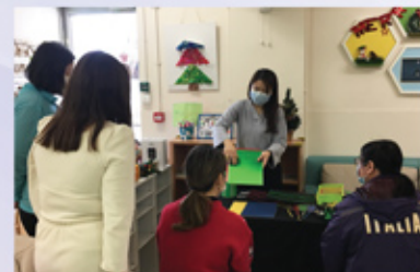
第五波疫情前的家長工作坊 Parent workshop held before the 5th wave of COVID