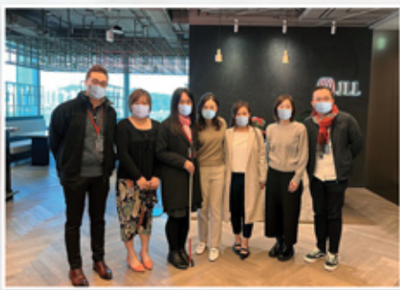
與仲量聯行進行會議 (相片攝於2021年11月) Meeting with JLL employees (Photo taken in Nov 2021)