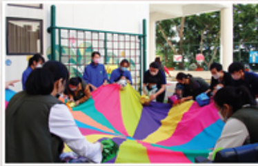
小小運動會 Mini Sports Day