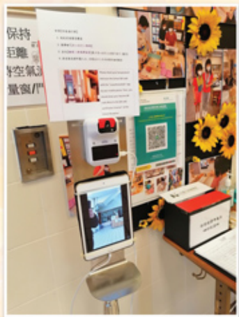
全院範圍配合政府實施疫苗通行證安排 Ebenezer premises implementing vaccine pass