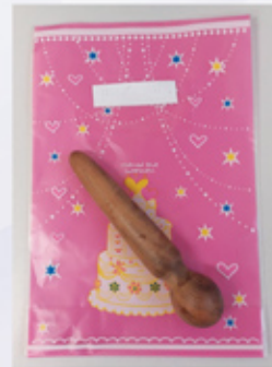
發給參加者的點穴棒 Every participant is given an acupoint massage stick