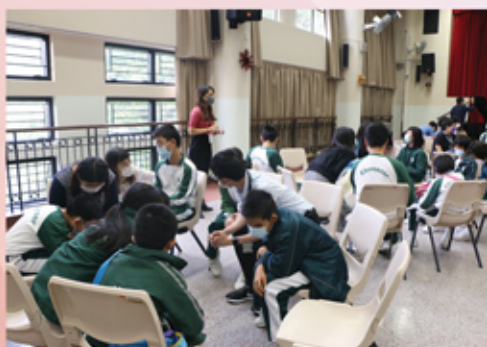
學生十分投入地以英語討論 Students actively participate in English discussions