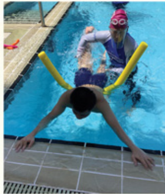
利用輔具學習自由式的踢腳 Learning leg movement with the assistance of noodles