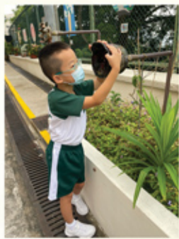
遠方的朋友，我的心聲你都聽到嗎？ Friends from afar, can you hear my thoughts?