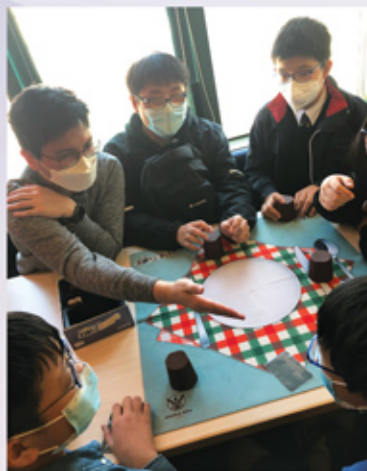
同學們專注地玩桌上遊戲 The board games keep the young people occupied for hours