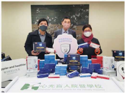
鳴謝會德豐地產(香港)有限公司捐贈大量快速抗原測試(RAT)包 Our deep gratitude to Wheelock Properties (Hong Kong) Limited for donating RAT kits in bulk