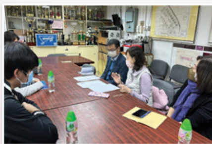
與瑞安建築有限公司商討合作機會 Job prospects discussion with SOCAM Development