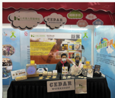
工展會攤位 CEDAR Workshop's booth at the Hong Kong Brands and Products Expo

CEDAR Workshop獲社會福利署、勞工及福利局邀請，分別在2021年12月19至26日及2021年12月31至2022年1月3日於工展會設置攤位，讓社會大眾認識及了解視障人士的能力。是次攤位中售賣的產品以各款木製杯墊及夜燈盒為主，我們的服務對象及義工亦落力參與其中，除了向在場人士講解及推銷產品外，也不忘分享自身經歷，吸引了很多市民前來了解及支持。總括而言，是次活動不但為「有作為」帶來額外的收入，也讓服務對象及義工獲得深刻而難忘的工作體驗，亦加深了社會大眾對視障人士的理解，意義重大。