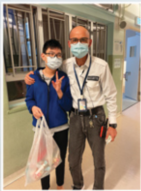
宿生送聖誕禮物予職員 Boarders giving Christmas gifts to staff