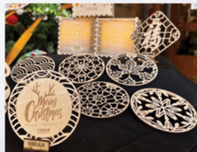
木製杯墊及夜燈盒 Our wooden coasters and lantern cases