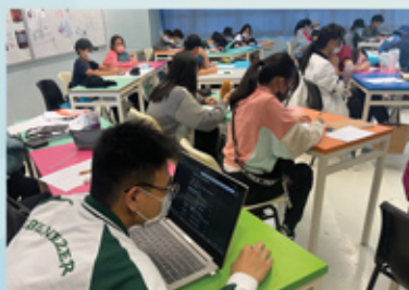
中學同學努力投入課堂學習 Enjoying learning with the HKSC students