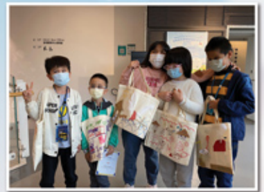
學生運用不同觸感材料製作環保布袋 Students use different tactile materials to make recycled bags