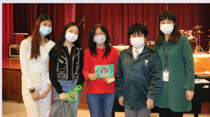
致送紀念品 Ebenezer students presenting souvenirs to the teacher and student representatives of CDNIS