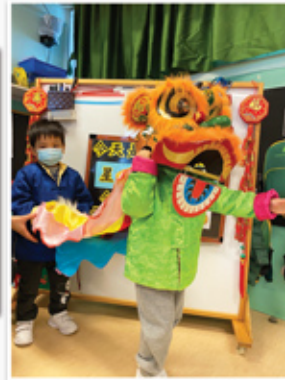
一起慶祝農曆新年 Let's celebrate Chinese New Year together