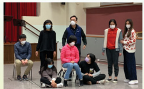
心光同學與其他演員在心光禮堂進行戲劇綵排 Our students and all the actors had their staging rehearsal in Ebenezer school hall