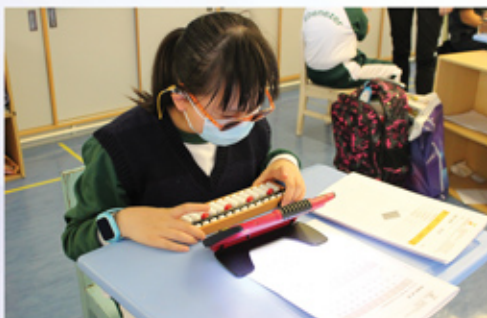
學生學習撥珠的技巧 Learning the finger position and movement techniques