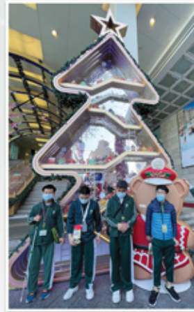
高中戶外學習課 Senior secondary students' outdoor learning activities