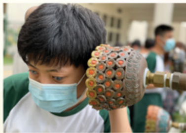
同學側耳傾聽傳聲筒 Lean in and listen!