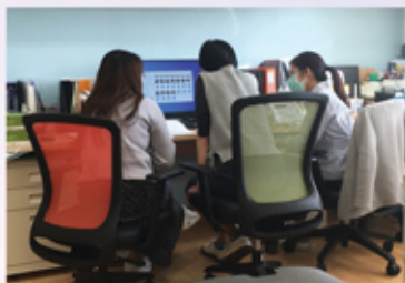
老師和治療師討論學生的支援方案 Teachers and therapists are devising individual support plans for children and their parents