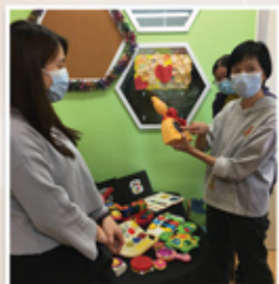
治療師示範如何使用教材 Therapist demonstrates how to train children using toys