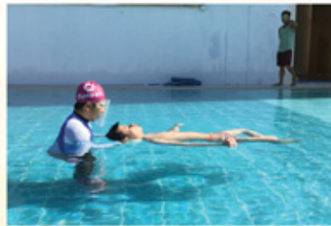
學習浮起 Floating in water