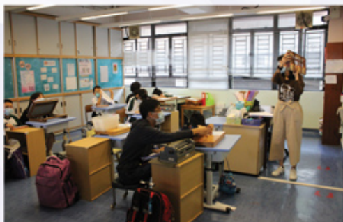
學生正在學習珠心算 Students are learning abacus mental calculation

數學科於10至11月期間邀請校外珠心算導師到校，為高小學生舉辦了四次珠心算體驗課程。上課時，同學需要耳聽、手撥及腦算，以提升集中力和記憶力，幫助他們建立基礎運算概念。參與課程的學生都積極投入課堂，過程中踴躍發問及回應導師的提問，並能於限時內完成指定的練習。同學能運用所學到的技巧去解決數學難題，課後亦能應用撥珠技巧及背誦口訣。