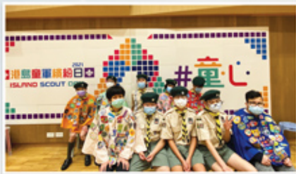
童軍們穿起特色營火袍，體驗室內營火會 Scouts wear their signature campfire robes and experience an indoor campfire