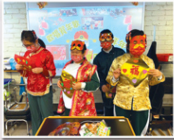
新年大會 Chinese New Year activities