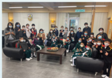
民生書院小學校長、老師及學生大使熱情款待心光師生 The hospitable principal, teachers and student ambassadors of Munsang College Primary School