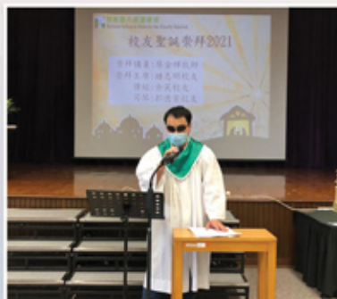
校友聖誕崇拜2021 Alumni Christmas Service 2021