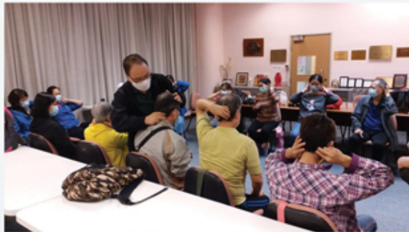
物理治療師教導校友認識穴位 Understanding acupressure