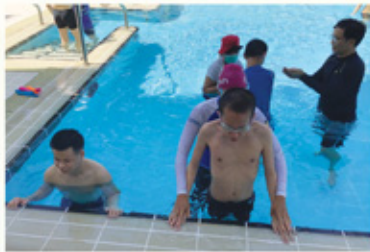
學生以小組形式按個別差異學習游泳 Small group teaching according to individual differences

有了義工的協助後，老師可以把同學按學習差異分成小組。怕水的同學先嘗試利用腳蹼接觸水，再把整個身體浸入水中。有的同學十分喜歡玩水，但欠缺安全意識；老師便先讓同學在水中圍繞池邊行走，然後嘗試浮起手、腳。部份學生表現大有進步，甚至可自行游泳，令人欣喜。