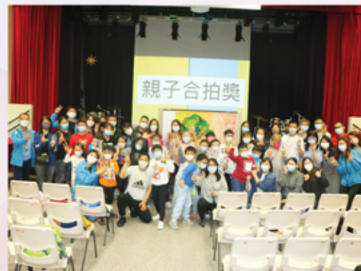
家長和同學積極參與競技活動 Enthusiastic participants of the parent-child races