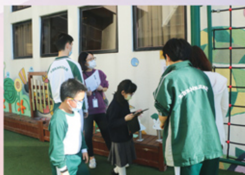
學生解答數學題目 Students are solving Maths problems