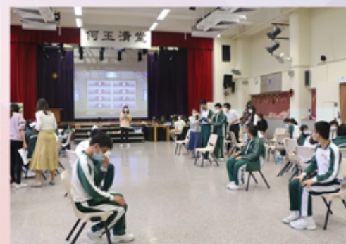
每組派代表搶答「最受老師歡迎的興趣是……」 Each team sends a representative to guess the top answers of "The most popular hobby among teachers"