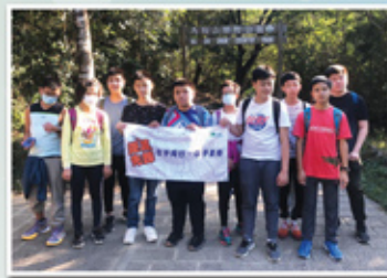
學生完成20公里路程 (圖片攝於2021年11月) Students completed the 20km journey (Photo taken in Nov 2021)