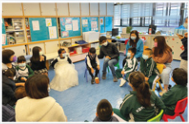
同學在聖誕派對中一起玩集體遊戲 Students play games together in the Christmas party