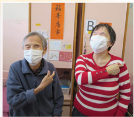
安老院友齊打疫苗 Our elderly ladies taking vaccine