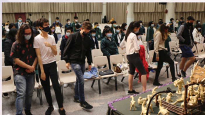
齊步學跳Hokey Pokey The audiences learn the dance moves to "Hokey Pokey"