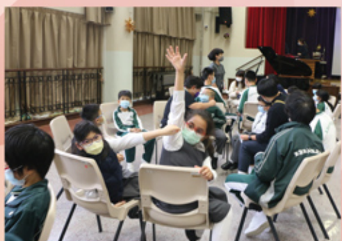
學生在過關問答比賽中踴躍答題 Students are eager to answer the questions