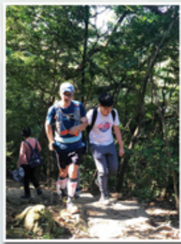
義工和學生結伴參與「逆旅先鋒」，挑戰崎嶇山路 (圖片攝於2021年11月) Volunteers and students conquered the rugged mountain trail together in the Inner Challenge event (Photo taken in Nov 2021)