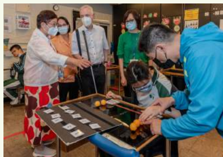
參觀心光恩望學校 Ebenezer New Hope School Visit