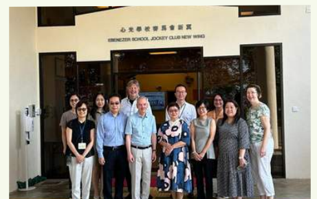
歡迎德國差會蒞臨 Welcoming HBM guests

'I will lead the blind by ways they have not known, along unfamiliar paths I will guide them; I will turn the darkness into light before them and make the rough places smooth. These are the things I will do; I will not forsake them.' (Isaiah 42:16)