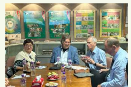
回顧及願景分享會 Review and Vision session

For the history of HBM and their missionaries in Hong Kong, please view our 125th Anniversary Book at https://www.ebenezer.org.hk/tc/125th-anniversary-book