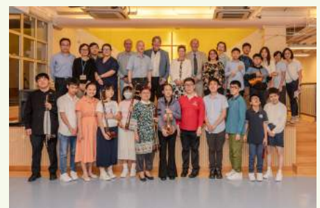
小型音樂會 At mini-concert