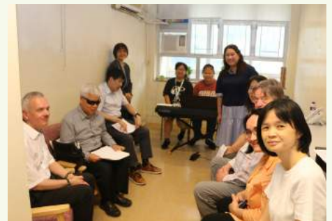
與福音事工的校友見面 Meeting alumni at Christian Ministry