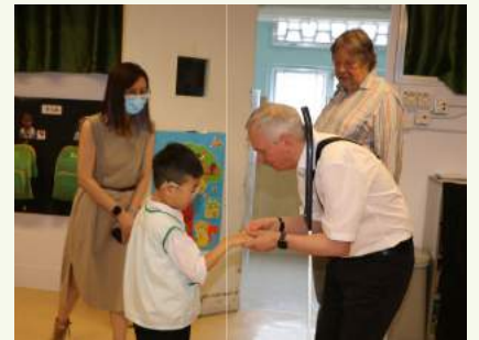
參觀幼兒中心 ECCC Visit