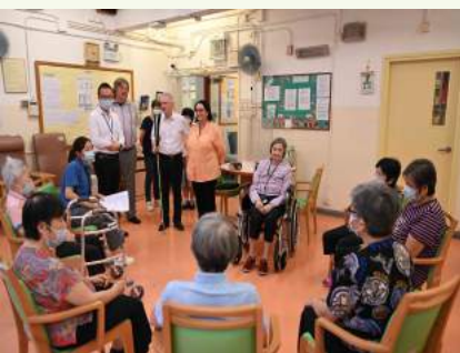
參觀安老院 C&A Home Visit