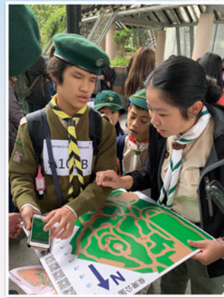
童軍在公園進行定向活動 Scout Orientation Activity