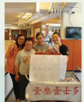
新年大抽獎 Chinese New Year Lucky Draw