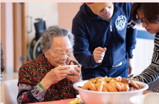
院友享用豐富盆菜宴 Let's feast