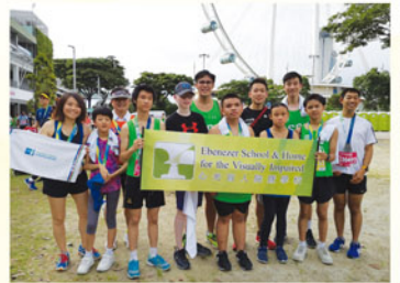
順利完成比賽 We've finished the race!