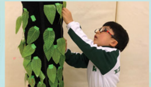
學生運用手眼協調能力及核心肌肉耐力完成活動 Student participates in tasks that challenge his eye-hand coordination and core muscle control