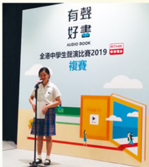
學生參與有聲好書複賽 Our student takes part in the semi-final of the competition