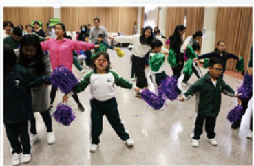
英語跳舞日 English Dance Day