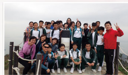
西高山遠足活動 High West Hiking