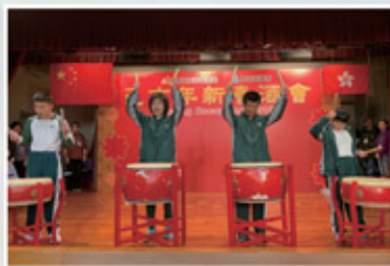
為兩區新春酒會揭開序幕 Performance at the Spring Reception of the Southern District