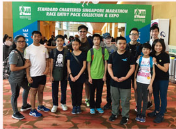
到會場領取選手包 We have a group photo at the entrance before we start