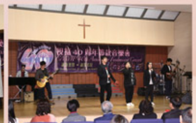
同場演出的Sparkling樂隊成員同為心光學校畢業生 The Sparkling comprises 7 members who all graduated from Ebenezer School.