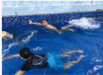
進行游泳恢復訓練 Swimming recovery training