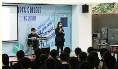
視障社工帶領視障音樂人到一所中學分享生命故事 Our V.I. social worker and musician motivate students at a secondary school.