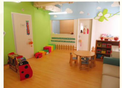
現時的中心接待處 New reception area