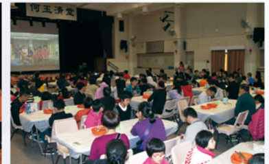
宿生和家長們濟濟一堂，欣賞同學們製作的賀年片段 Enjoying the video of best wishes from our boarders