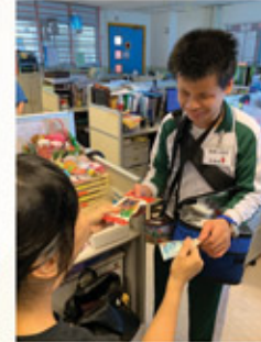
小食亭外賣員為老師送上健康小食 Healthy Delivery to the staff room