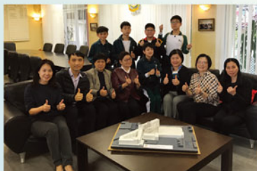
院長與民生書院小學校長、眾參與老師及學生合照 Our CEO, Principal of Munsang College Primary School and teachers and students of both schools