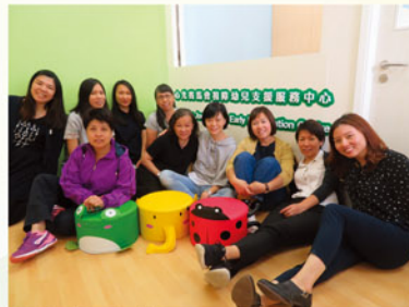
現時中心團隊成員 Our current team members