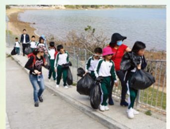
學生把拾獲的垃圾送至回收站 Students carry the rubbish to the recycling station