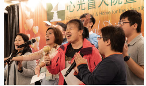
心光敬拜隊獻唱 Ebenezer Worship Team