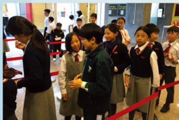
熙雯與民生書院學生在課餘交流 Students at Munsang are friendly towards our students