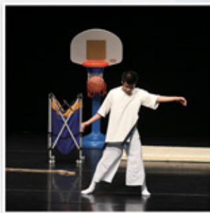
以《希望》為題參加第55屆學校舞蹈節 "When I believe", our dance at the 55th Schools Dance Festival