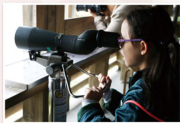
濕地公園觀鳥活動 Bird watching at Hong Kong Wetland Park