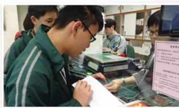
學生在郵政局學習郵寄信件 Students try mailing letters in the post office