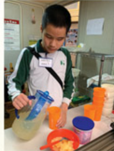
小食亭服務員為同學沖調健康飲品 The student is preparing healthy drinks for classmates