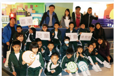
初小學生到香港兒童探索博物館，於遊玩中探索 P.1-P.3 students visit The Hong Kong Children's Discovery Museum