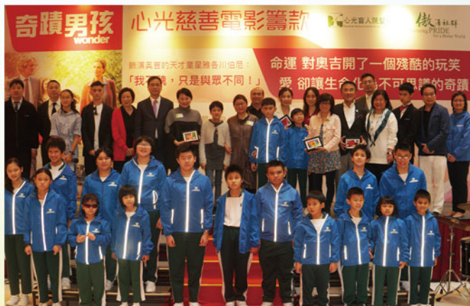
一眾嘉賓及心光學生合照留念 Our students have a photo with all our guests