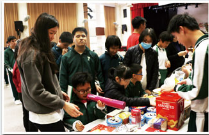
以物易物活動 Barter Party