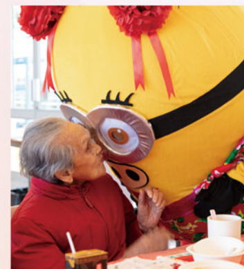
親親吉祥物 Big Kiss from the mascot