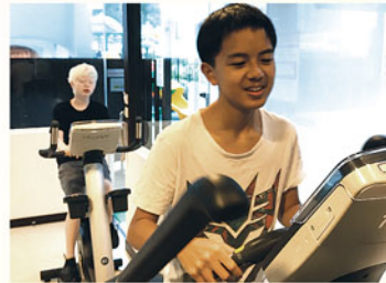
進行帶氧恢復訓練 Oxygen recovery training