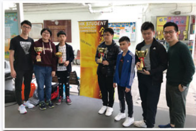
小學及中學同學於全港學生科技大賽中奪得多個獎項 Primary and Secondary students win different prizes in Hong Kong Technology Competition