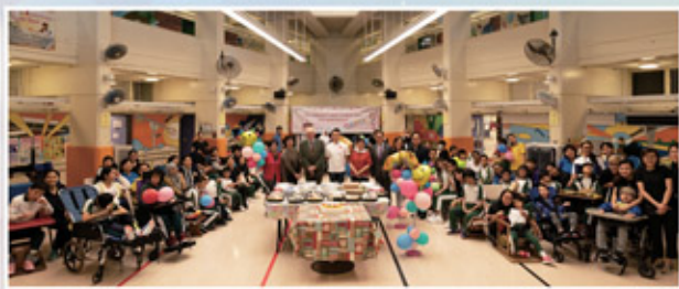
公益金50週年生日派對 The Community Chest 50th Anniversary Birthday Party