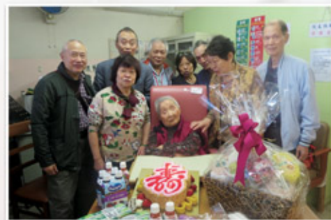
院友前學生恭賀院友99歲生辰 Celebrating our resident's 99th birthday