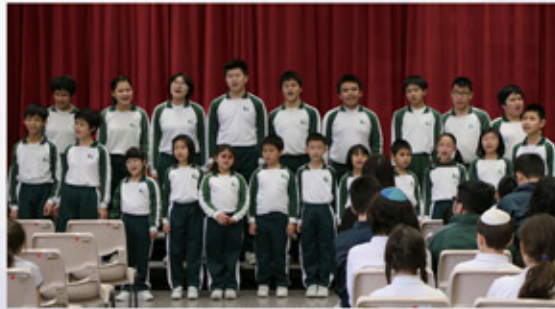
心光合唱團於交流音樂會演唱了三首二部合唱作品 Ebenezer Choir performed three two-part choral pieces in the music exchange concert