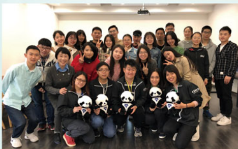
【松心體驗】5位職員為成都YWCA的20多位年輕領袖進行視障體驗培訓 5 staff from Cedar was training the youth leaders from Chengdu YWCA.