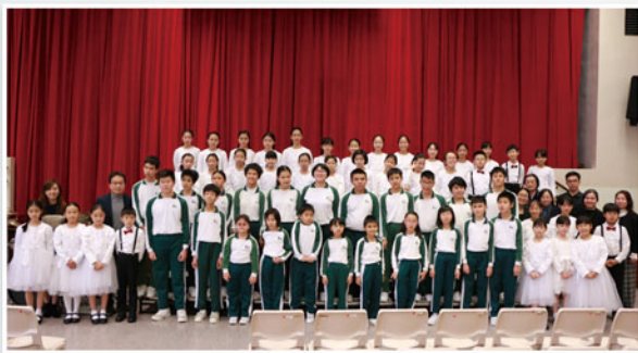
天水圍小天使合唱團與心光合唱團進行音樂交流活動 The TSW Little Angels Children's Choir and Ebenezer Choir had a music exchange on 8 March 2019