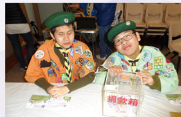
請大家多多支持，購買我們的童軍獎券 Please support our scout raffle ticket sale