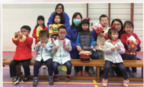
心光幼兒中心一起感受農曆新年氣氛 Ebenezer Child Care Centre celebrating Chinese New Year Together