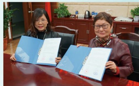
院長與成都市特殊教育學校簽訂姊妹學校協議 CEO signed the collaboration agreement with Chengdu Special School