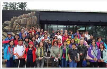
2019福光團契旅行—西貢遊 2019 Fuk Kwong Fellowship Outing@Sai Kung