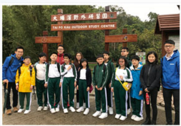
高小學生到大埔滘自然護理區考察 P.4-P.6 students visit Tai Po Kau Nature Reserve