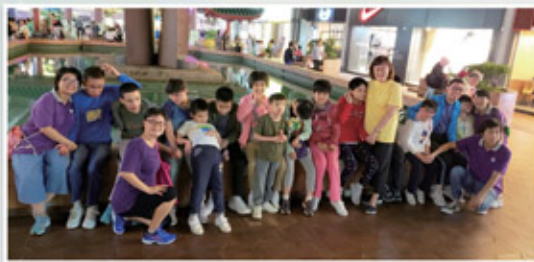
宿生分組外出活動 Boarders' group outing