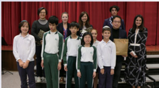
兩所學校校長、音樂老師、合唱團代表及獨奏者合照留念 A photo of the principals, music teachers, representatives of both choirs and soloists from both schools