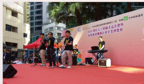
The hong kong band成員們都盡情投入在熱熾的表演氣氛中 The hong kong band had a great time performing live