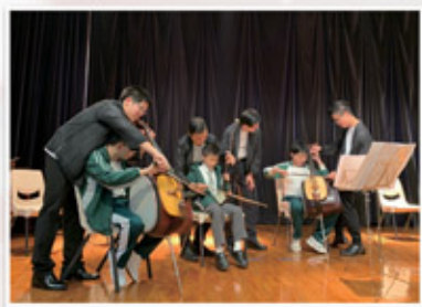
香港中樂團到校音樂會 Students play the erhu and guqin with Hong Kong Chinese Orchestra's musicians