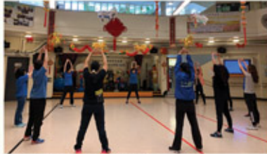
職員運動日—齊跳Hip Hop Staff exercise – let's hip hop

與此同時，我們亦十分關注員工健康。除了每月一次由專業同工帶領的運動日，亦邀請了不同醫護人員舉辦健康講座。我們還舉辦了「有營快送」活動，由同學為教職員送外賣，鼓勵同事選擇健康小食和飲品。以上眾多活動，旨在提高師生對健康的關注，共同實現「健康校園」。