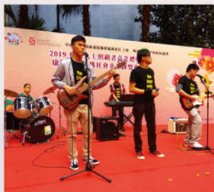
The hong kong band 以音樂帶出傷健共融的訊息 The hong kong band promotes inclusion through their music