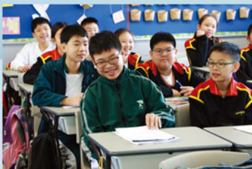
心光學生們十分享受課堂 Students enjoy learning with a big crowd