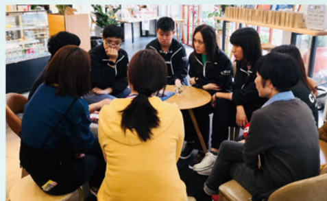
舉辦培訓的場地同時是一所社企咖啡廳，【松心體驗】職員正與其負責人交流營運社企的心得 The training venue is a cafe under social enterprise model. Cedar staff was exchanging ideas with their officials.

當我們在活動結束前詢問他們的感受時，台下的發言非常踴躍，令活動延遲20分鐘才完結。原來，不斷的嘗試，才是打破隔膜的不易法門。