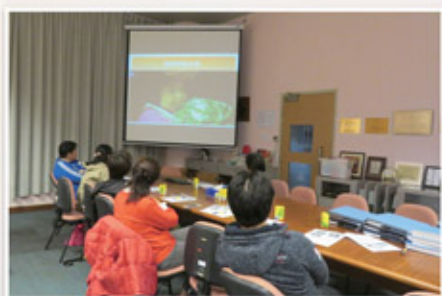
家長參與CVI講座 The parents are learning about cortical visual impairment