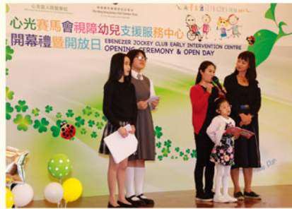
家長分享 Parents' sharing