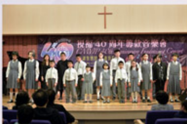
心光合唱團演唱了三首詩歌，感動人心 Ebenezer Choir sang three hymns in the concert to praise God