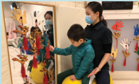
學生參與前庭及觸覺統合訓練 Our training encourages the student's vestibular and tactile integration