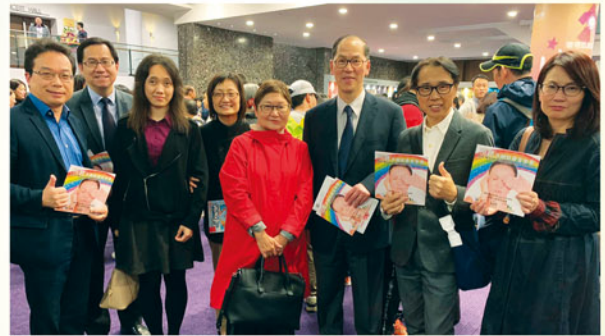
Friends of Ebenezer supporting the 'One World, One Love, One Concert' at HK City Hall on 14 March