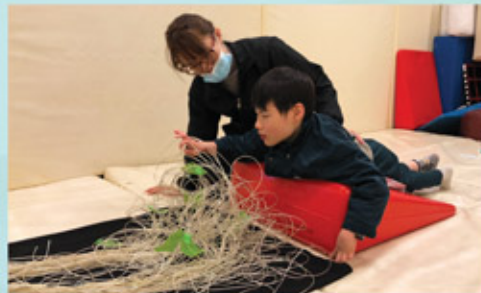
透過觸覺及視覺刺激發展學生的中線活動能力 Tactile and visual stimulation are used to facilitate mid-line orientation skills