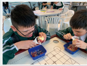
生活技能訓練 Living Skill Training