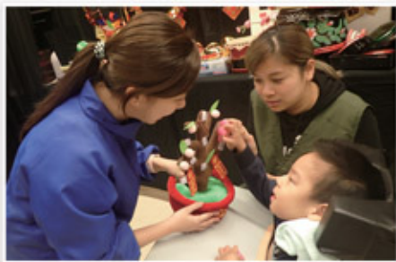
心光幼兒中心仁愛組學生學習如何拿取及觸摸東西 An ECCC student is learning how to "take" and "touch"