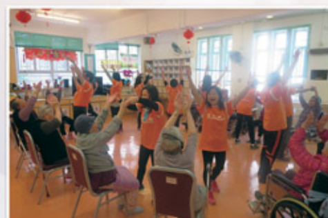
愛笑瑜珈 Laughing Yoga