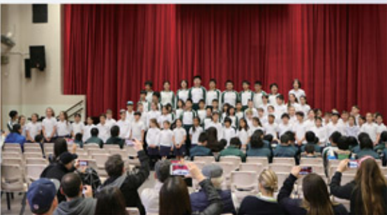
交流音樂會以兩合唱團合唱《我要向高山舉目》作完滿總結 The two choirs sang "Lift my eyes up to the hills" together as the concert finale