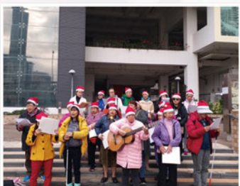
12.2018 姊妹組報佳音 Christmas Carol by Sister's Group