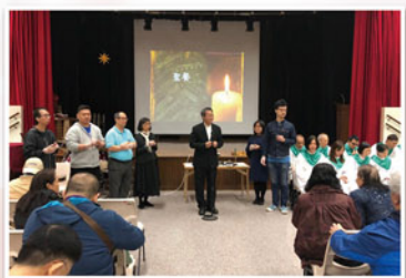
12.2018校友聖誕崇拜(聖餐) Holy communion @ Alumni Christmas Service 12. 2018