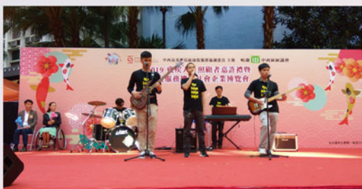
The hong kong band於博覽會進行音樂表演 The hong kong band performed in the Recognition Ceremony