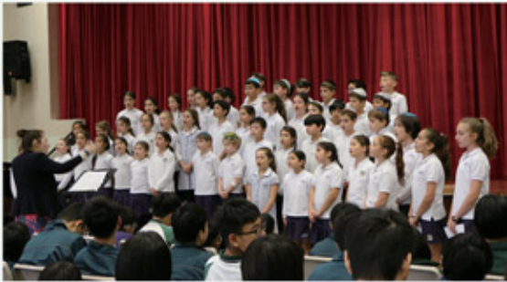
香港猶太教國際學校合唱團由三至五年級的學生組成 Carmel Elementary Choir comprises Grade 3-5 students of Carmel Elementary School