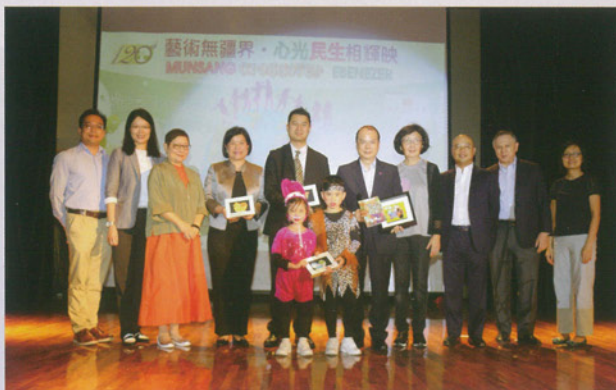
致送由心光學校學生自製的手工藝品給張建宗司長及眾嘉賓 Mr. Matthew Cheung Kin Chung, GBS, JP, and the guests were presented with souvenirs made by Ebenezer School students.