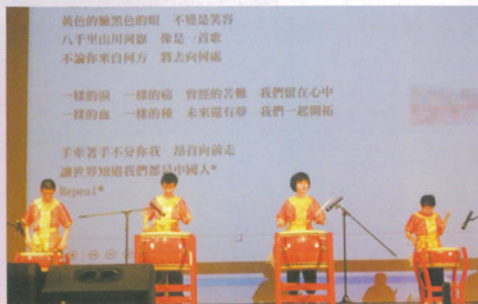
SAME聯校音樂表演 Joint School Music Performance by SAME Network