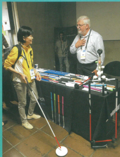
向推銷員了解「圓碟」白杖的用法 Try & discuss the special long cane