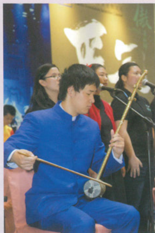
樂器與歌聲之結合 Blending instruments and singing