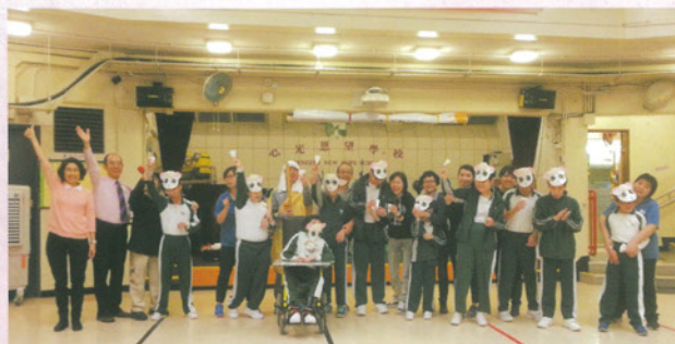
復活節義工活動 Volunteer Service in Easter Party