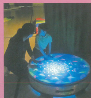
運用符合學生興趣和能力的教材，成功讓學生「自主學習」 Using learning material suited for student's individual ability and interests is the key to "self-directed learning".