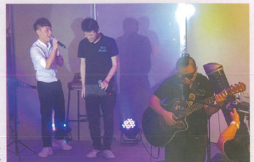
於愛·瞳心慈善音樂會 Perform@Kit Lam Concert