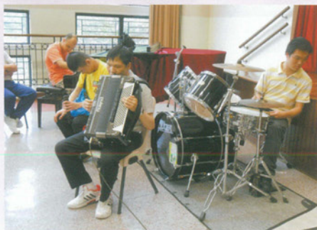
校友樂團開鑼啦！ The Alumni's Band started practice again!