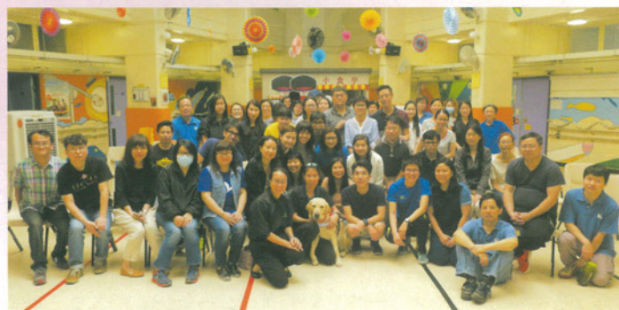
職員培訓--香港導盲犬服務中心簡介 Staff Development -Introduction of Hong Kong Seeing Eye Dog Services