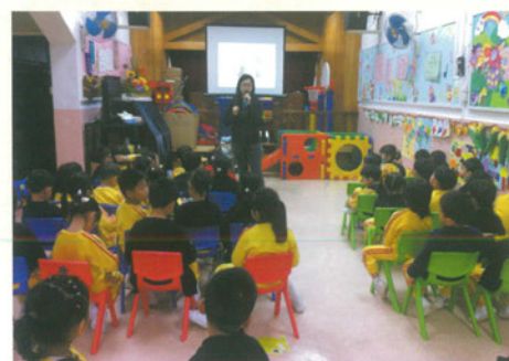
「視障朋友I SEE U」到校講座 "I SEE U" Talk for Kindergarten