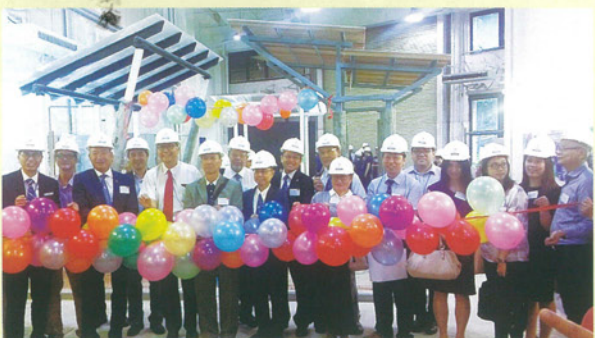
@PolyU IC's Donation Ceremony of Shelters designed & constructed by PolyU BRE students, and materials donated by Registered Minor Works Contractor Signatory Association and Contractor's Authorised Signatory Association