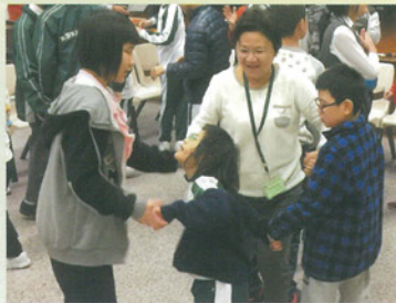
放輕鬆，讓我們一起玩 Relax, let us play together!