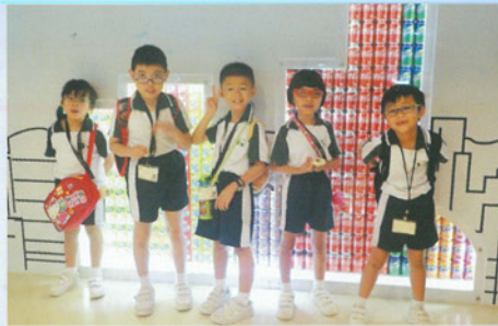
參觀可口可樂廠 Visit to Coca Cola Company