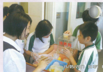
合作社義賣活動 Students' Union fund-raising activity