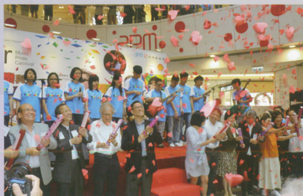
眾嘉賓鳴放花炮為《樂與傲嘉年華》展開序幕 All the guests and performers kicked off 'Our Music Our Pride Carnival' on stage.