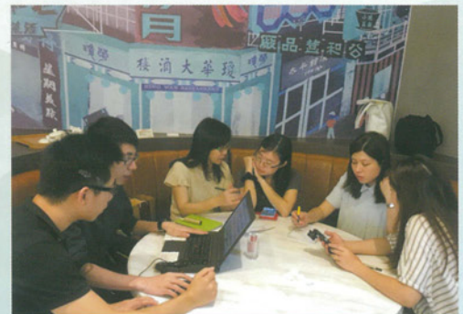
在杭州機場候機室內，團員爭分奪秒，分組總結交流團成果 Beefing up the presentation preparation at Hangzhou Airport