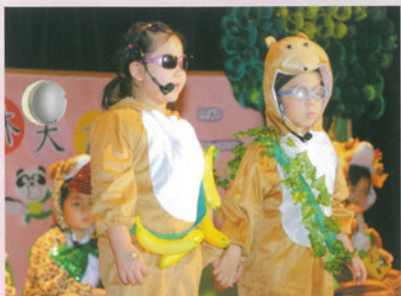
<藝術無疆界.心光民生相輝映>才藝匯演 Ebenezer Talent Show "MUNSANG crossover EBENEZER"