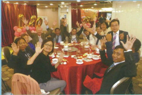
Our VIPs, volunteers, overseas guests and colleagues having a blast!