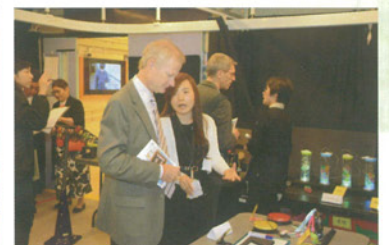
教學示範及展示教具 Guest learning about how the teaching aids for the visually impaired are used