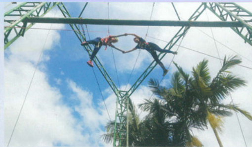
歷奇挑戰日營 Adventure training day camp