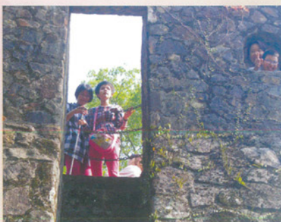
「我到達了！」於仿古觀星台拍照留念 "Here we are!" @Astronomical Observatory

心光學校家教聯於五月一日舉行了「西貢親子一日遊」的活動，當日有100多位家長、教職員和家屬一同參與。早上，我們遊覽了西貢海下灣海岸公園。海下灣水清沙幼，環境優美，參加者皆樂而忘返。中午，我們於西貢市中心午膳及遊覽，隨後再往水浪窩參觀仿古觀星台。當天，學生、家長和教職員樂也融融，盡興而回！