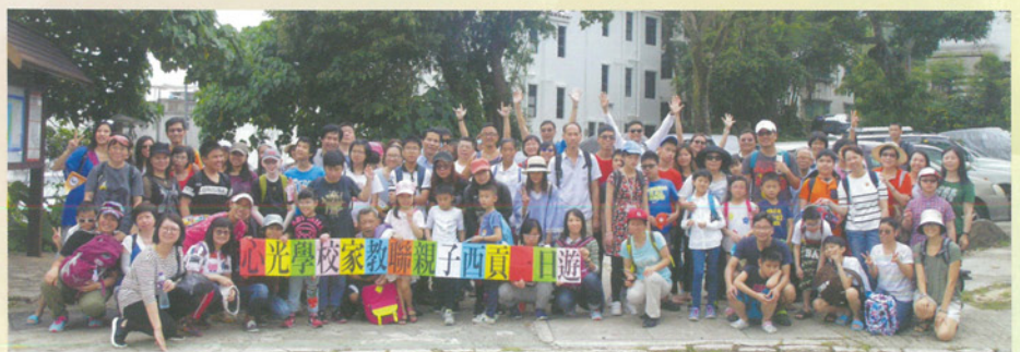
學生、家長及職員大合照！ Group Photo with all the students, parents and staff members