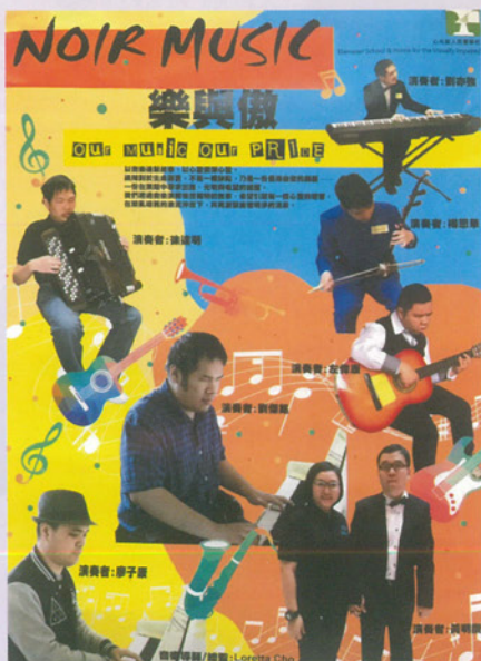
音樂總監與主要成員 Music director and core members

視覺障礙及生活中的逆境讓這些年青年人學會用心去觀看世界，以信心克服各種挑戰，並懷著感恩的心答謝所獲得的栽培，回饋社會。