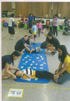
競技日 Sports Fun Day