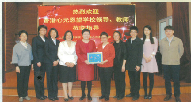
與上海市盲童學校簽署姊妹學校計劃締結書 Sister School Scheme Contract Signing Ceremony with Shanghai School for the Blind