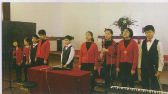
歌詠團於安素堂表演 Choir performance @Ward Memorial Methodist Church