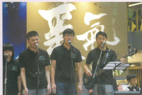
與健視成員演出 Perform with the sighted members