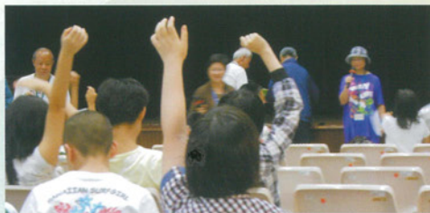
「我來！讓我來！」 'Me! Choose me!'

聖經中引述：「所以你們要彼此接納，如同基督接納你們一樣，使榮耀歸與上帝(羅馬書15:7)。」義工與校友是同步而行的，有時也分不清是誰施予，是誰接受。雖說義工付出了時間、精神和金錢來幫助我們的學生、校友，但同時藉著與他們的交流，感受到他們的可愛和堅毅的信心，反而讓義工得著大大的激勵。