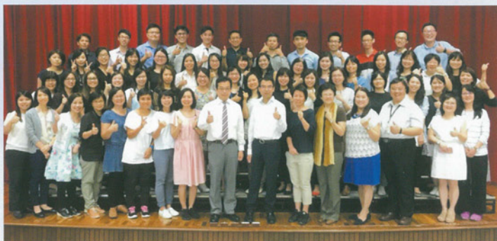
教師及專職人員大合照 Teacher and specialist staff photo