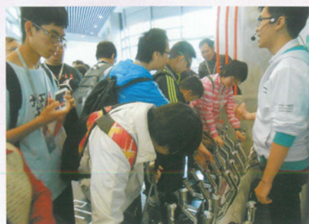
校友也來支持環保，參觀「源·區」 Alumni participated in environmental protection, visited the T.Park