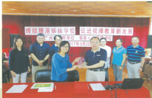
與廣州啟明學校簽署姊妹學校計劃締結書 Sister School Scheme Contract Signing Ceremony with Guangzhou Blind School