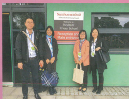
參觀英國的特殊學校 Visit to the special schools in the UK