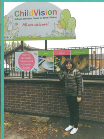
參觀當地機構 Field visit to ChildVision