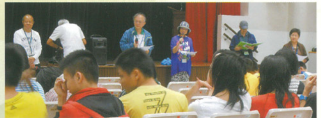
義工與學生互動 Volunteers interacted with students