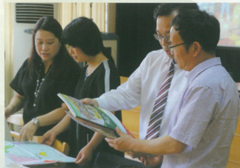
與浙江省盲人學校領導分享心光送贈的教材及教具 Souvenir presentation to leaders of Zhejiang Province Blind School