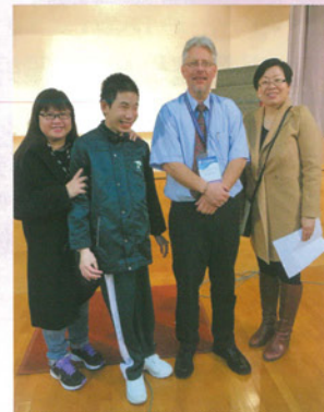
參加校際音樂節(鋼琴獨奏) Participating in Hong Kong Schools Music Festival (Piano Solo)