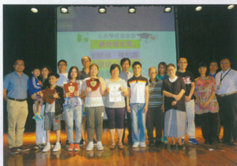
最佳宿生頒獎禮 Ceremony for Best Boarders