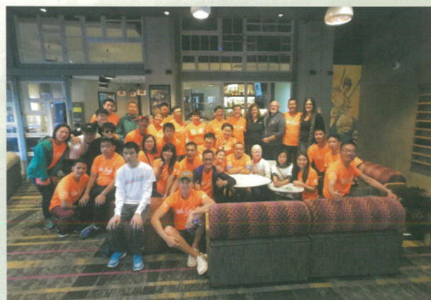
與澳洲主辦單位及香港大會團員合照 with the Australian organizer and HK Team members