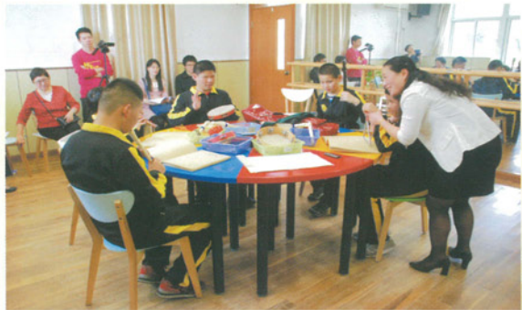
上海市盲童學校的音樂課 Music Class at Shanghai School for the Blind

承蒙香港教育局的資助，本校參加了為期三年的「姊妹學校計劃」，促進兩地的專業交流和發展，為視障教育展開新的一頁。我們於本學年分別到訪廣州及上海，與廣州啟明學校和上海市盲童學校簽署姊妹學校計劃締結書，共同承諾雙方互動和合作。藉著這次實地考察，我們能深入了解內地特殊教育在學與教、復康及職業導向訓練的發展，實在獲益良多。我們深信透過此計劃，必能加強兩地於視障教育和服務的溝通，提升教育素質，令視障人士獲得更大裨益。最後，我們萬分感謝廣州啟明學校、上海市盲童學校及華東師範大學附屬盧灣輔讀實驗學校的熱情招待和安排。