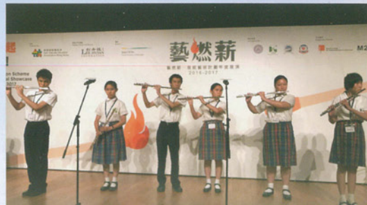
長笛演奏@藝燃新 (香港展能藝術會) Flute performance @Ignition Scheme Showcase (ADAHK)