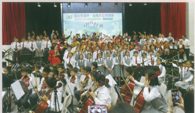
民生和心光所有表演者携手唱奏出《We are the world》掀起全场高潮 All the performers gave a stunning performance of 'We are the world'.