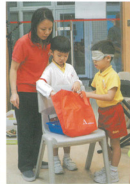
生命教育工作坊@民生書院幼稚園 Music Live in Hope@Munsang College Kindergarten