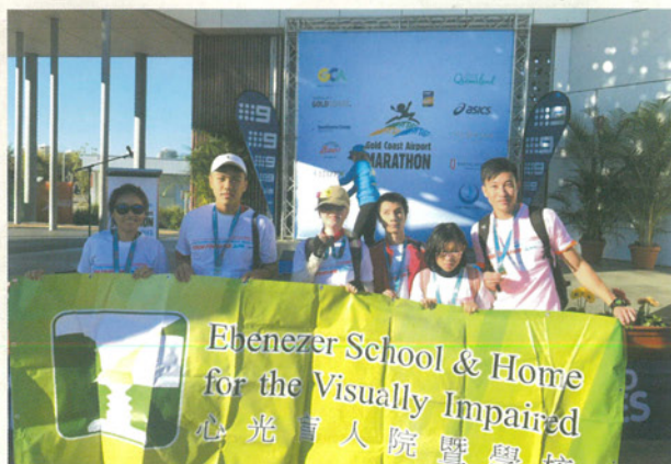
澳洲10公里馬拉松心光大合照 Ebenezer@10 km Marathon in Gold Coast, Australia