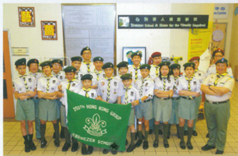
童軍活動 Scout Activity