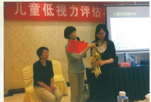
於江蘇省視障幼兒研討會中擔任講員 Sharing at Nanjing Maternity and Child Health Hospital