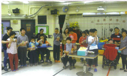
恩望 - 生日會 Birthday Party