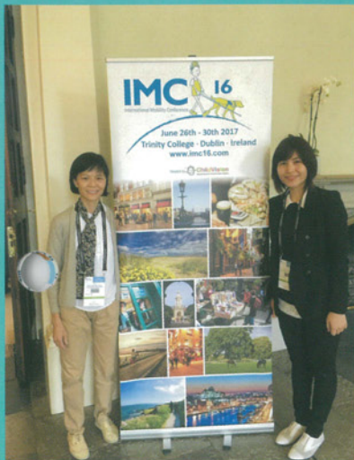
熱切期待大會開始 Looking forward to IMC 16