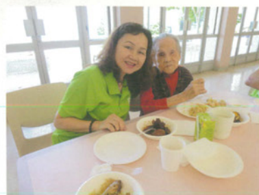
端午節慶祝會 Dragon Boat Festival Celebration