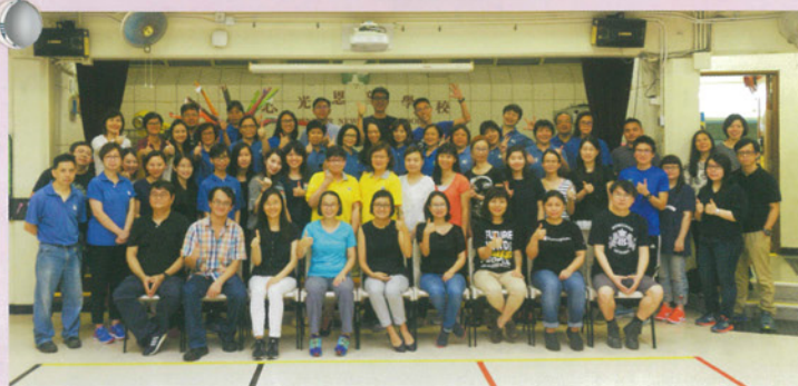
職員大合照 Staff group photo