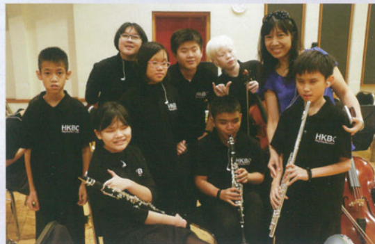
管弦樂團成員於香港文化中心演出 Orchestra members perform at HK Cultural Centre