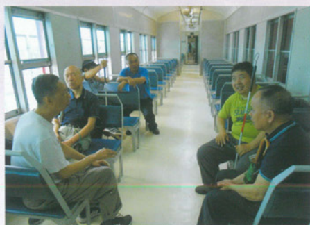
弟兄組探訪新組員兼坐在舊火車卡上懷念一番 Brothers Fellowship Group members visited new members, while sitting on a train cabin in Tai Po Railway Museum