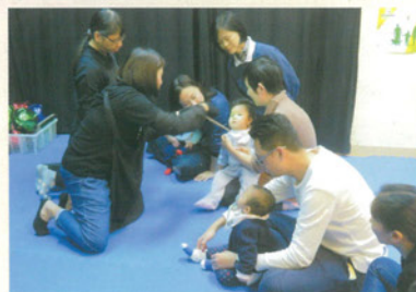
EIP CVI小組 EIP CVI Group Activity