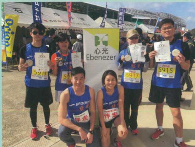
各人皆獲豐碩成果 Good results attained @Okinawa Marathon