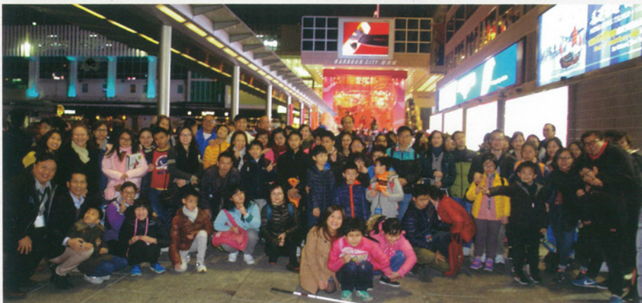
親子春宴元宵遊 Lantern Festival Walk