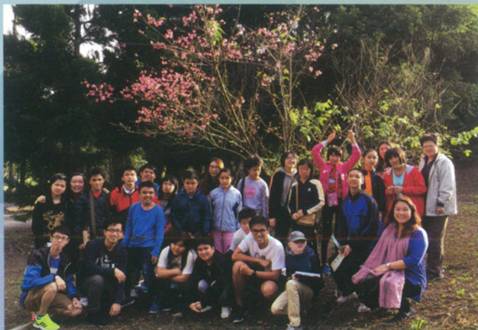
三峽碳中和環保樂園開的第一株櫻花 Witnessing the first cherry blossoms @Sanxia Carbon Neutral Park