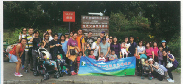
共享郊遊自然樂-親子活動 A fun day in the countryside