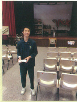
使用航拍機製作校園環保片段 Producing a video clip with Drones Player to promote environmental protection