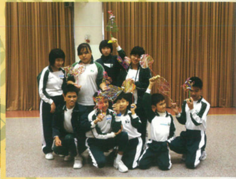
展能藝術會活動日 The Arts with Disabled Asso.(ADA) Activity Day