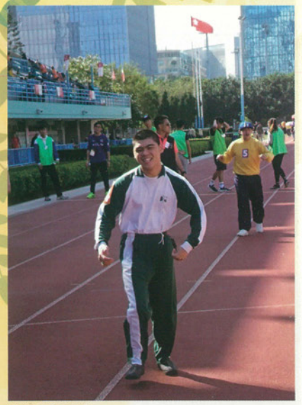
特殊奧運會 The 41st Special Olympics Hong Kong