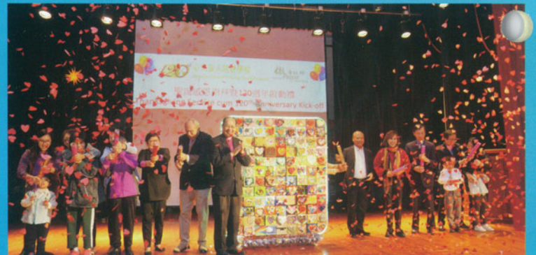
啟動禮鳴禮炮儀式 A 'cannons-firing salute' @Kick-off Ceremony