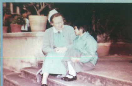
祁姑娘與小女孩傾談 Sister Lore interacts with a girl