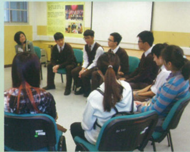
分享「Give and Take 體驗活動」的感受 Sharing after "Give and Take Activities"