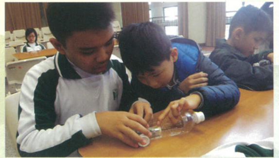
製作環保電動車 Making an electric car