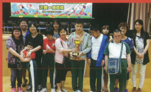
手語歌比賽(亞軍) 1st Runner-up in the All Hong Kong Inter-Primary Schools Sign-a-Song Contest