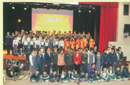
PLA(HK Garrison) visits Ebenezer on 19 December