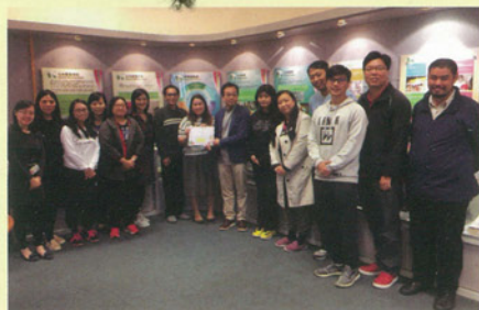
In-service teachers taking the EdUHK SEN Course on VI education @ Ebenezer