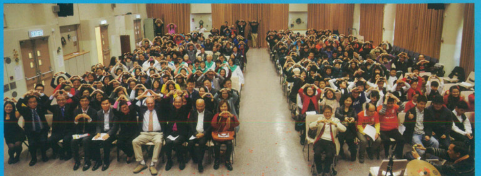
120啟動禮大合照 Our 120th Kick-off group photo filled with hearts!