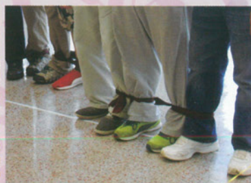
校友也來running man, 三人四足比賽 The alumni played the famous 'Running Man' game – a four-legged race.