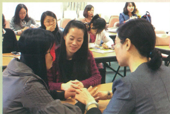
同工在實踐中學習 Mainland colleagues practising new skills