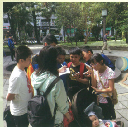
於北投綠色建築圖書館外訪問當地市民 Interviewing the locals @Beitou Library