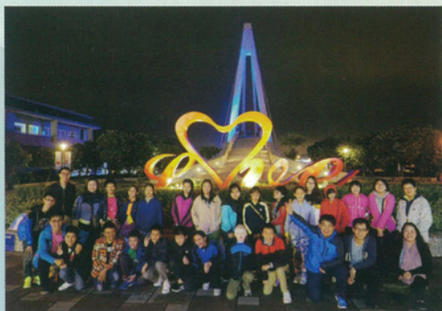
夜遊台北淡水情人橋 Touring Tamsui Lover's Bridge by night