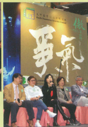
多位嘉賓在「心光龍門陣」分享 Sharing session by our guests