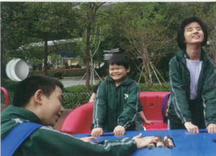
公園樂趣多 Look how happy they are!