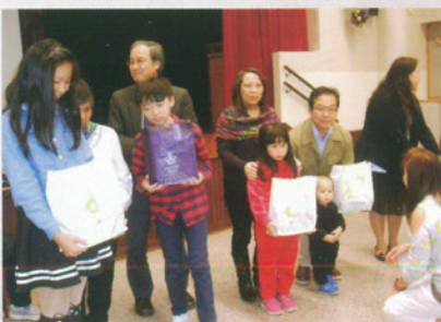
校友子女領取聖誕禮物 The alumni's children received Christmas presents.