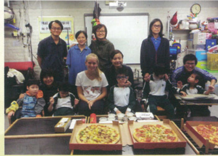
Farewell party @New Hope School