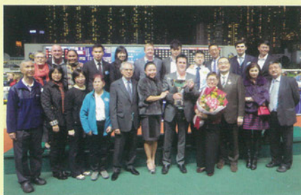
Ebenezer 120th Anniversary Cup in Happy Valley Racecourse on 15 March