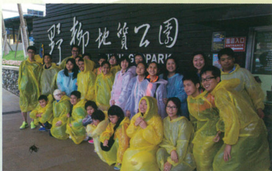
參觀野柳地質公園 @Yeh Liu Geo Park