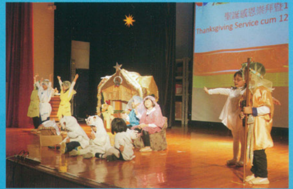
幼兒中心學生所演的的聖誕劇 Christmas drama by students of Child Care Centre