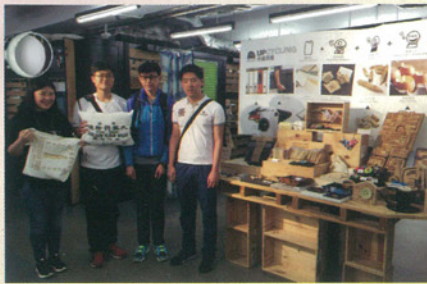
訪問聖雅各各升級再造中心 Interview with St. James' Settlement Upcycling Centre

除此之外，在跨學科學習週二，為了推動校內的環保意識，我們進行升級再造活動，讓全校師生有機會利用環保物料進行升級再造，體驗箇中的樂趣。初小同學以紙包飲品盒製作陀螺和玩具車，高小同學以膠樽製作電動車，中學同學則以航拍機拍攝校園內的環保設施，輔以剪接和配音等效果，製作心光環保校園宣傳短片。活動既能發揮學生的創意，又能有效提升學生資訊科技的素養，極具教育意義。