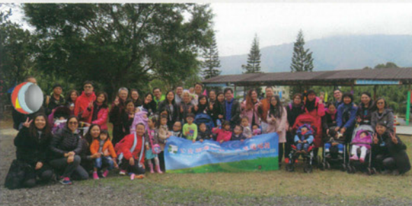
「EIP送猴迎雞賀新春」親子活動 Happy Picnic in the Year of the Rooster