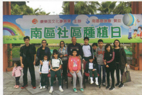
親子社區服務活動--南區社區植樹日 Southern District Community Planting Day