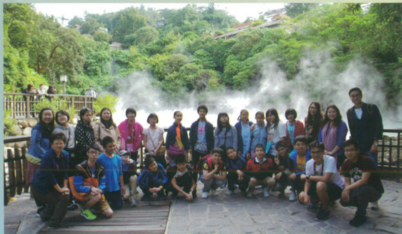
北投地熱谷留影 @Beitou Geothermal Valley