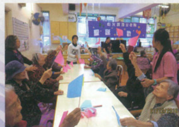
聖誕慶祝會 Christmas Celebration