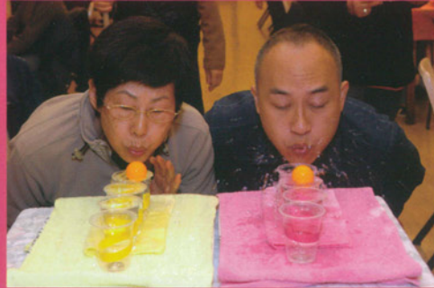
家屬投入地玩遊戲 Our guests enjoyed the games very much!