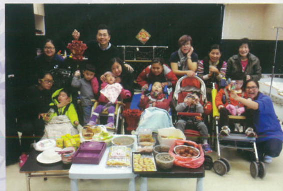
團團圓圓團年飯 Our reunion dinner