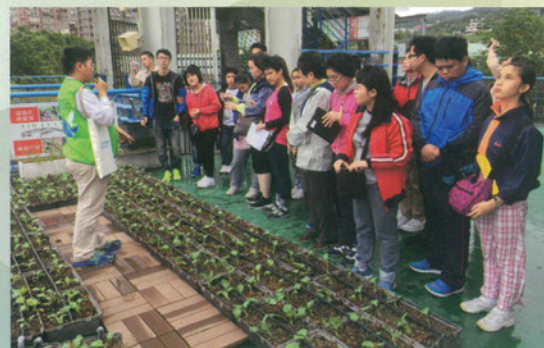
參觀新北市永續環保中心 New Taipei City Sustainable Development Education Center