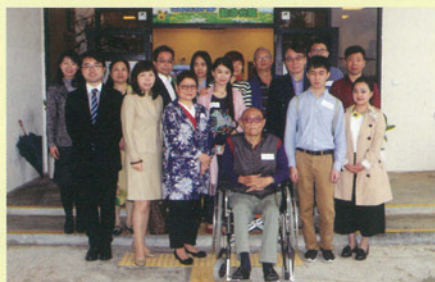
Visit by Zhengweining Charity Foundation (鄭衛寧慈善基金會)