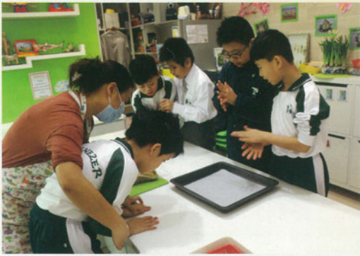
初小同學參觀寶山幼兒園 Primary students visit Braemar Hill Nursery School