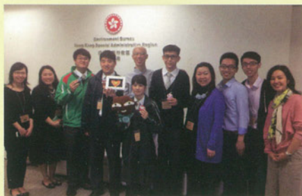
Ebenezer students interview Mr. Wong Kam-sing, GBS, JP, Secretary for the Environment