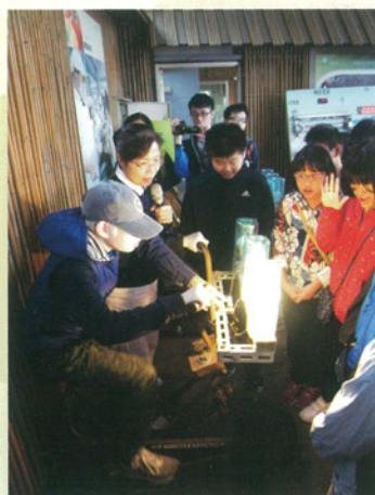
於慈濟環保中心留心聽義工講解 @Tzu Chi Eco-Education Station