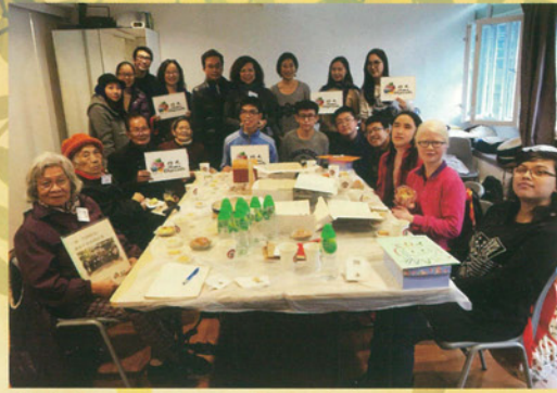
外讀生為安老院長者譜寫生命故事 Integrators interviewing elderly to write their life story