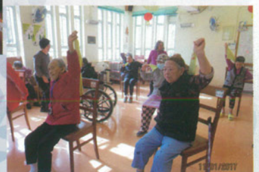
毛巾操 Towel Exercise