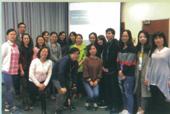
「有作為」的青年也為國內同工培訓及分享 Our Project WORKS managers offer training