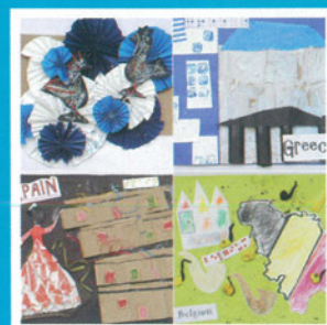
所有獲獎作品已印刷在2017年歐盟日曆上 All the winning entries are printed on the European Union calendar 2017