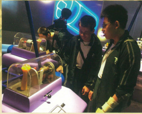
探索科學館 Visit to the Science Museum