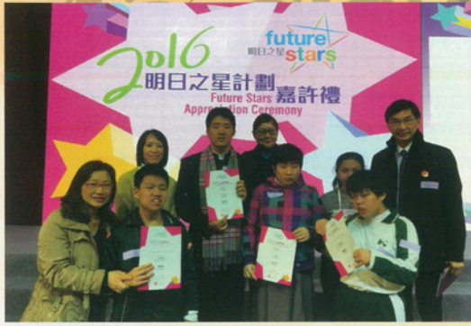
心光兩校四學生獲明日之星獎 Outstanding students of both schools awarded as Future Stars