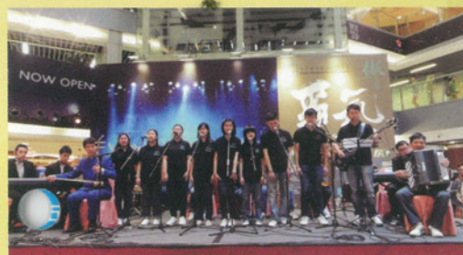
心光實驗樂團的演出獲得熱烈的掌聲和鼓勵 Marvellous music performance by NOIR Music