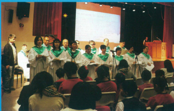
樂頌聖詠團 Cantata Choir