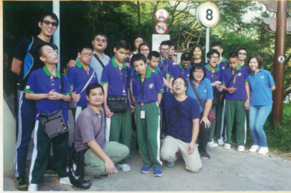
男童軍行山樂 Boys Scout Hiking Fun