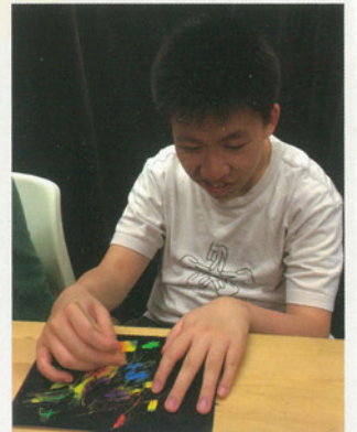
手工藝小組 Arts and crafts group