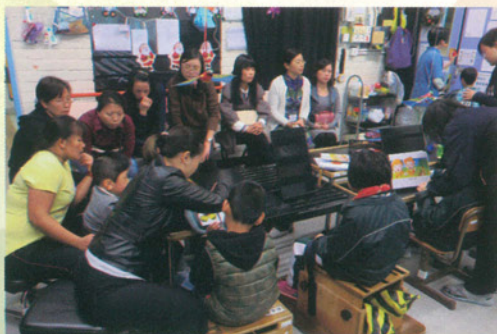
於恩望學校觀課 Class observation at New Hope School