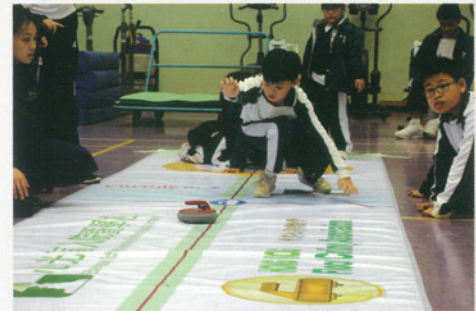
第一屆地壺球社際比賽 The First Floor Curling Competition