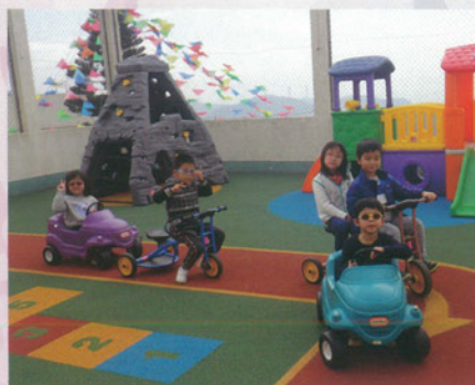
獲捐助建設感知遊樂場設施 New facilities with donations from Chinese Temples Fund