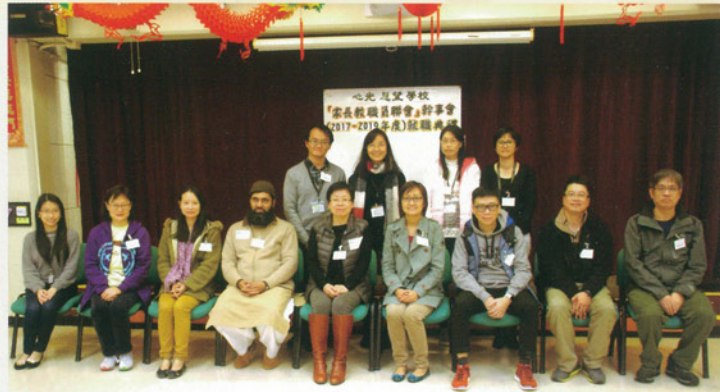
新一屆家教聯委員 Parents Staff Association Committee 2017-2019