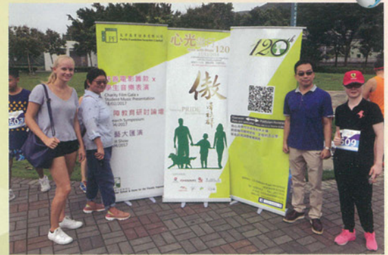
Florentine joining an inclusive activity @Sunny Bay