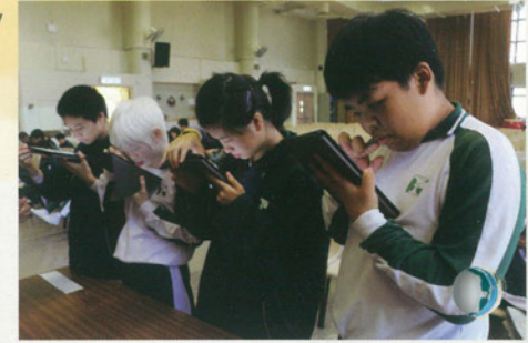
學生在進行數學PlayDay活動 Students are learning on Maths Play Day.