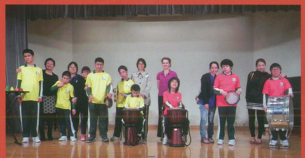
校際音樂節樂器小組比賽 Hong Kong Schools Music Festival