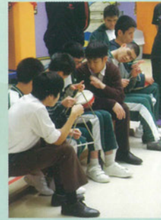
同學投入參與音樂活動 Students enjoying the music activity