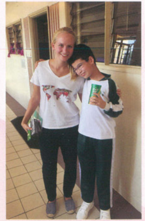
Exchanging gifts on last day