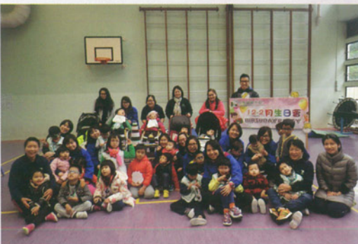
12-2月生日會 Our Birthday Party!