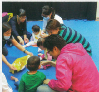
幼兒小組活動 EIP Group Activity